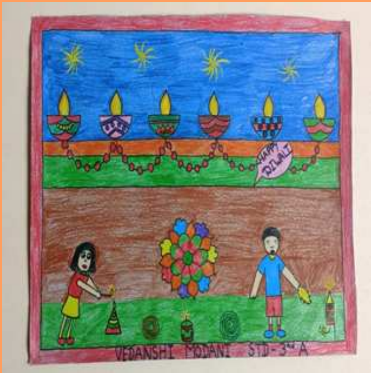
VEDANSHI MODANI STD-3-A DIWALI POSTER ACTIVITY